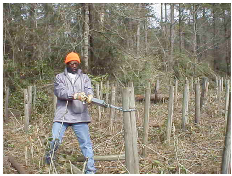
Example of 50 lb Pull test

The data from the evaluation was statistically analyzed using a variety of techniques (Wiebull Distribution and 90% Confidence Interval at the 60<sup>th</sup> percentile) and the results illustrate average life spans for many of the preservative treated pine posts. The average treated and untreated pine posts life span can be seen in the following Tables and Figures..